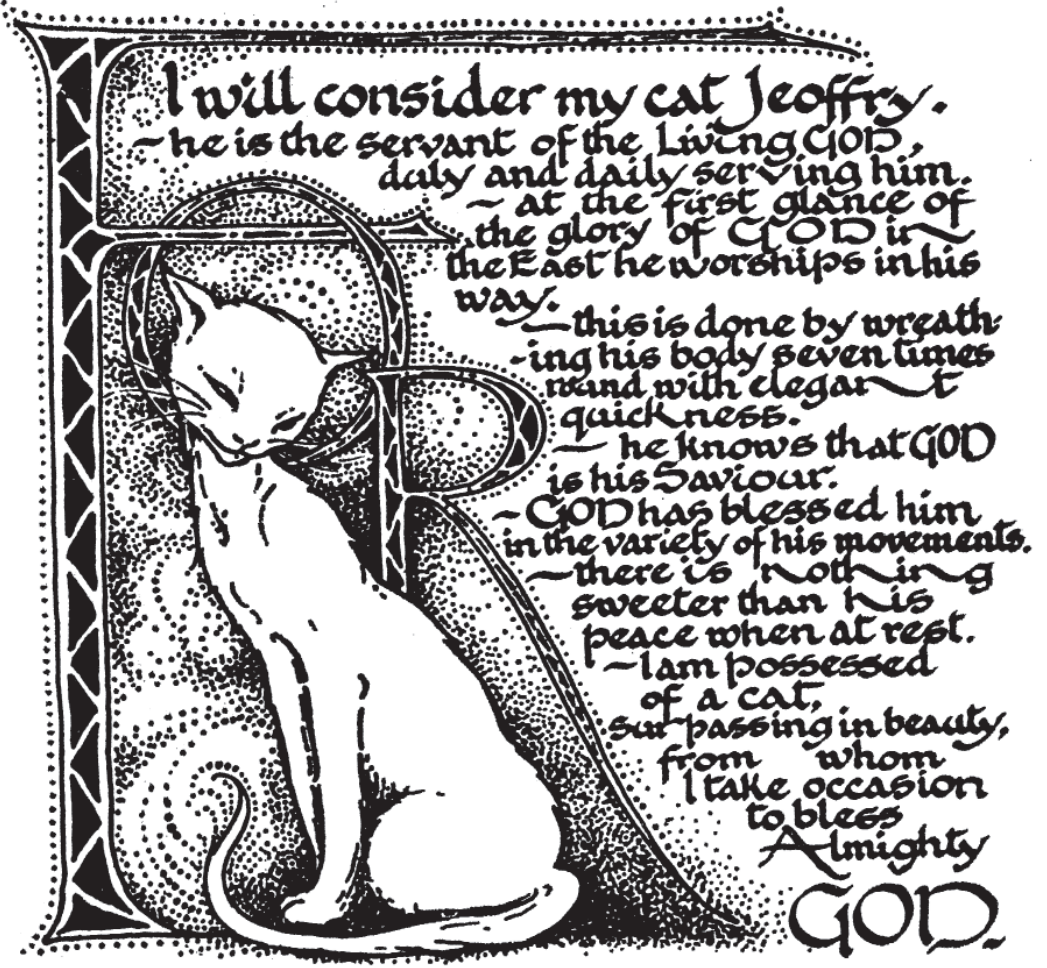
From a poem by Christopher Smart, 18th cent.